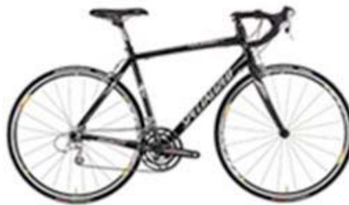
2004 ROUBAIX COMP