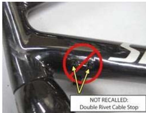
DOUBLE RIVET CABLE STOP IS NOT RECALLED

CPSC is still interested in receiving incident or injury reports that are either directly related to this product recall or involve a different hazard with the same product. Please tell us about it by visiting https://www.cpsc.gov/cgibin/incident.aspx