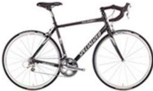
2004 ROUBAIX PRO

Consumer Contact: For additional information, contact Specialized toll-free at (877) 808-8154 between 9 a.m. and 5 p.m. MT Monday through Friday or visit the firm's Web site at http://www.specialized.com/us/en/bc/SBCGlobalPages.jsp?pageName=safety_recalls